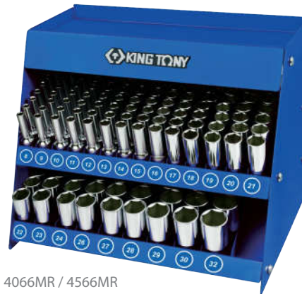
4066MR / 4566MR

Metal shelf size (mm) : 415x 336 x 320 (1.58 cuff)